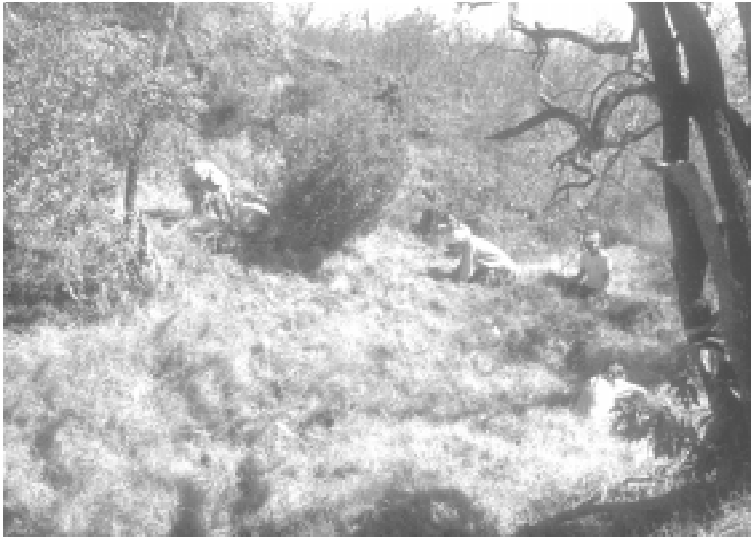
HSTP and other volunteers plant seedlings at the Auwahi preserve, in holes marked by small flags.