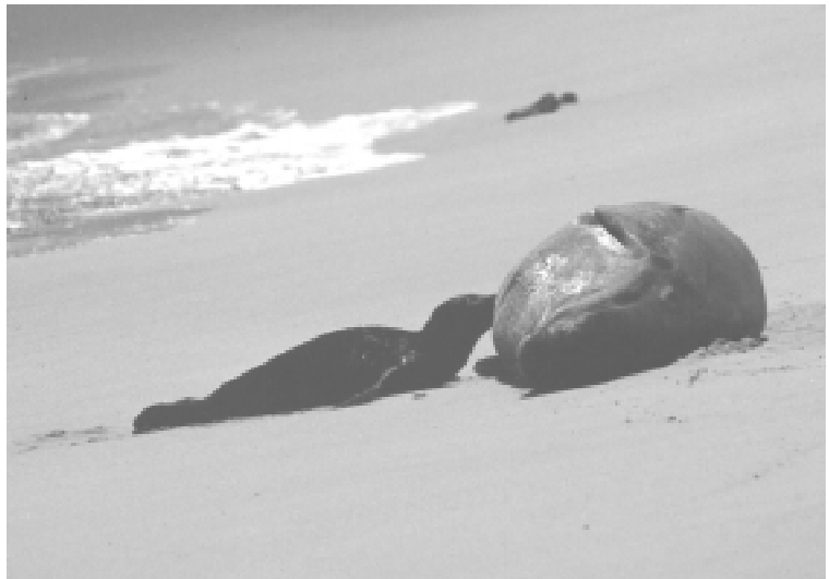
Mother Monk Seal Nurses Newborn at Maha`ulepu

Honu Group's offer would have to be accepted by 75% of