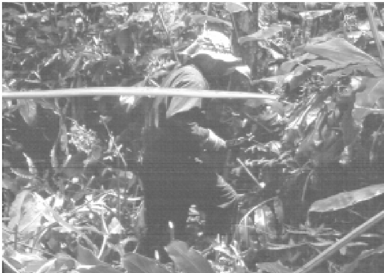
Hacking away at Khili ginger near N Huku, HVNP.

In addition to these projects HSTP worked on the Plehua-Palikea trail within the Nature Conservancy's Honouliuli Preserve. This work involved grading and widening the