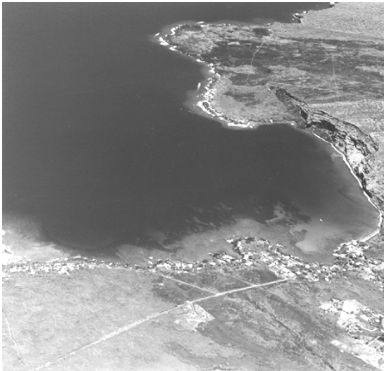
Historic Kealakekua Bay: Wild coastline or a gated community?

The West Hawaii Regional Plan recognized that South Kona is "predominantly rural and [residents] have expressed the desire to remain viable rural towns. These communities are preferred by many local residents as a desirable place to live in terms of amenity and lifestyle" (p.21). Gated communities catering to mainland millionaires do not fit the local ambience. Allowing this development to