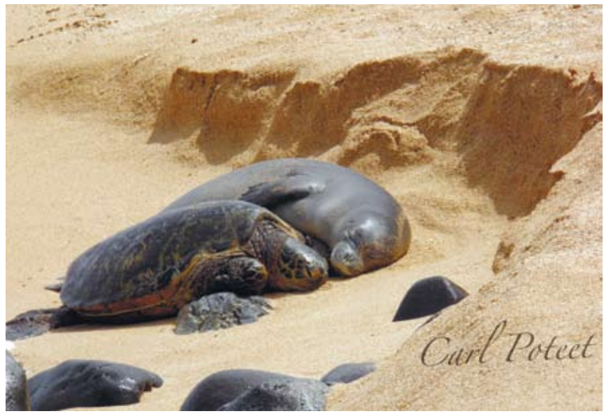
A Hawaiian monk seal and sea turtle enjoy each other's company on a North Shore beach on Kaua'i.

included NEPA successes, breakdown of the EIS process, finding community alternatives, creating stakeholder collaboration, monitoring and mitigation issues, litigation of NEPA cases, and cultural resource protections, among other topics. As our group members prepare to provide public comment and testimony on Environmental Impact Statements for proposed projects in Ha'ena and Koloa, we viewed this as necessary education on the NEPA process. We look forward to implementing this training in the coming months as we work to protect the Garden Island's precious natural resources.