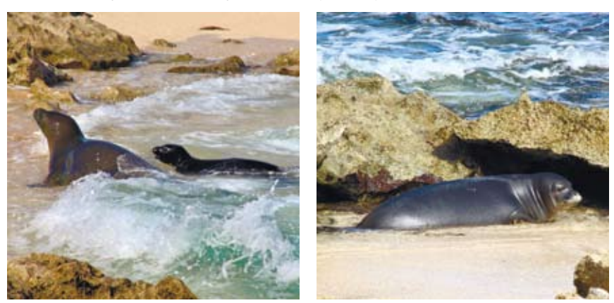
On the 24th day I saw Honeygirl and Ola Loa return from swimming in the ocean.