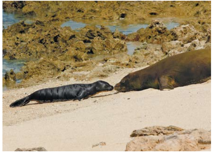
Ola Loa on Day 10... nose to nose with her mother, Honeygirl.