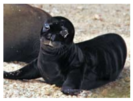
Honeygirl's pup "Ola Loa" at 4 days old.

There are only about 1,100 Hawaiian monk seals left in the world and their numbers are dropping by 3-4% a year. Most live in the Northwest Hawaiian Islands with only 200 in the main Hawaiian Islands. Their greatest risk is entanglement in nets, fishing lines, and other derelict fishing gear. In 2006, one of Honeygirl's pups—Penelope—got