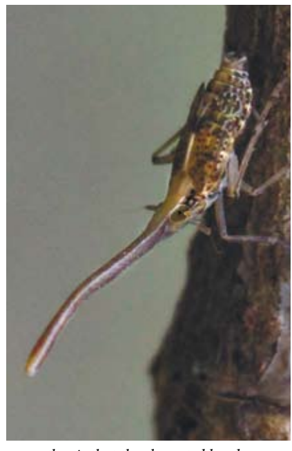
...another is that the elongated head camouflages the insect as a thorn or twig.