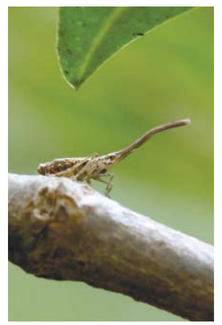
One theory is that the horn detoxifies the sap prior to digestion...

To see more of Nate's photos of 'akoko planthoppers, go to http://hawaiianforest.com/akoko-planthoppers-in-the-native-forests