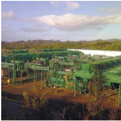
Puna Geothermal Venture