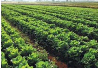
Koa Ridge farm lands plotted for development.

City. But they said it was “too late” to make these changes. Not one council member voted to oppose the project.