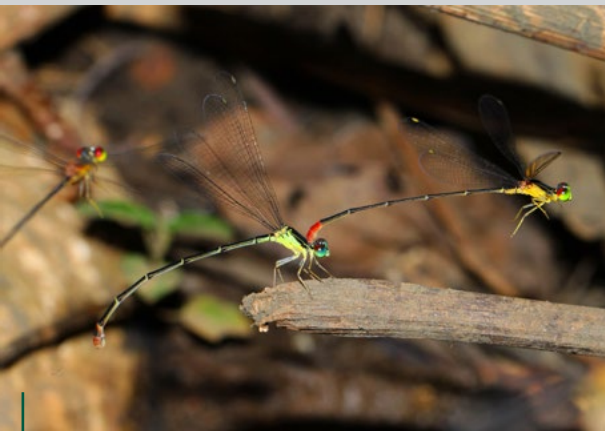
A rival male darts in to interrupt a pair of mating pinapinao ānuenuē.

The discovery of this unknown population of low elevation Blackline Hawaiian Damselflies in Kāneʻohe is a remarkable and significant find. Rainbow damselflies are unique to the natural history and heritage of Oʻahu and need to be protected. The Sierra Club Oʻahu Group will be looking to see how it can protect these damselflies for future generations.