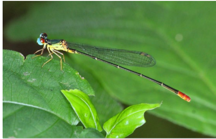
This female has large round eyes that are red on top and blue on the bottom. Females do not have a grabber at the tip of their abdomen.

I was surprised to see these damselflies in Kāneʻohe. I had previously only seen this species in native forests and streams above 2,000 feet elevation in the Koʻolau Mountains. I did not expect to see them at this low elevation in Kāneʻohe under alien trees – schefflera, albezia, strawberry guava, and other non-native vegetation. Damselflies are pinapinao in Hawaiian. There is an intriguing entry in the Pukui/