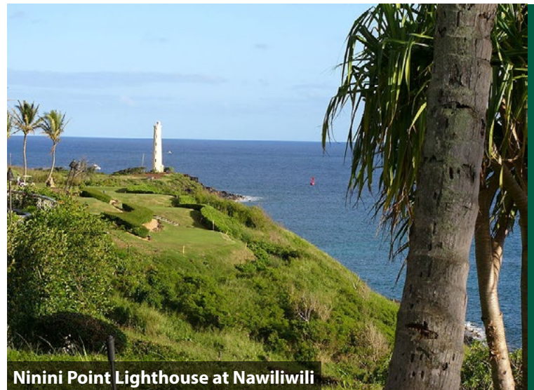
Ninini Point Lighthouse at Nawiliwili

Hike from Kalapakī Beach to Nawiliwili Lighthouse then along the coast to Hanamā'ulu Bay with shuttle to return. Enjoy views along the rugged coast. Leader: Ken Fasig, 346-1229