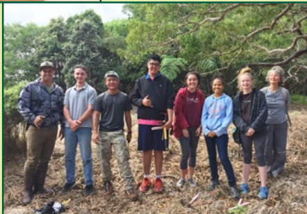
CLA students learning how to be a part of the solution in moving Hawai'i towards its 2045 renewable energy goals