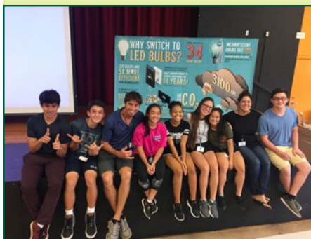
In November, High School Hikers attended the Blue Planet Foundation Student Energy Summit at Mililani High School