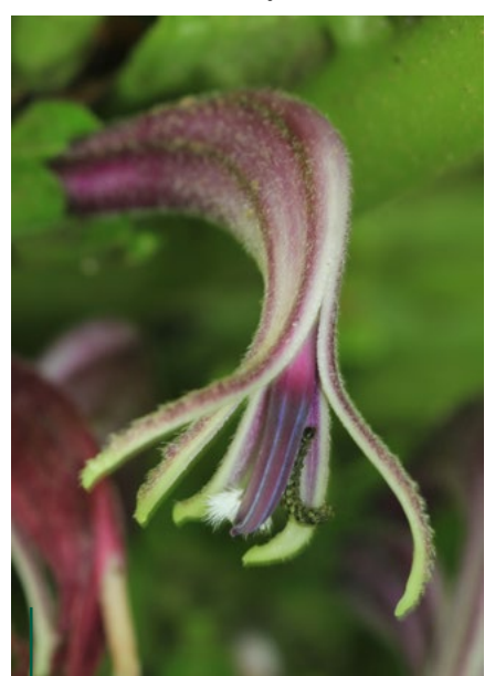
When I looked closely at the flowers I saw a tiny Eudonia caterpillar with an interesting texture and pattern on its body.

Because Cyanea crispa is vulnerable to extinction, the plant is cared for by the Plant Extinction Prevention Program. Seeds have been collected in the wild and the plant is being propagated at the Lyon Arboretum and the National Tropical Botanical Garden. I hope their efforts are successful to bring this plant back from the brink of extinction.