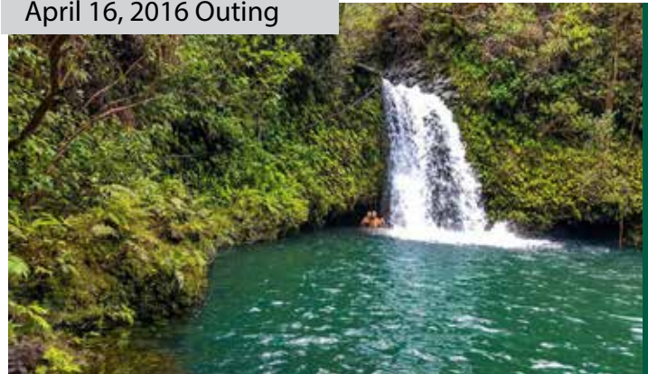
Makapipi Trail April 16, 2016 Outing