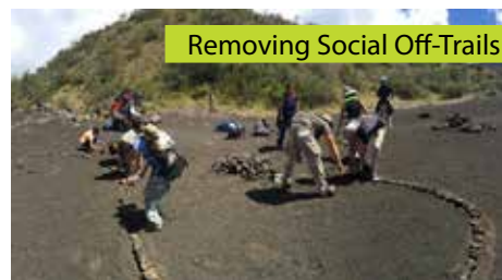
Removing Social Off-Trails