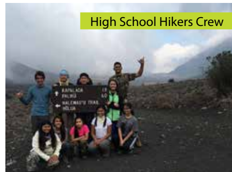
High School Hikers Crew

Overall, this experience was one we will never forget. We had an unforgettable journey through Haleakalā Crater, a place that not very many people get to see. Even though it was tough and uncomfortable at times, we learned a lot about hiking, native species and Hawai'i's unique geology. Mahalo nui Sierra Club for such a great opportunity!