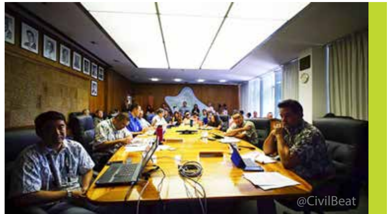
Board of Water Supply, public, and press hear from EPA on the status of the Administrative Order on Consent for Red Hill.

Following the EPA's presentation, several people testified. The public expressed concern regarding the Navy's refusal to guarantee safe drinking water; asked that the ancient tanks be decommissioned; and demanded prompt clean up of contamination. Despite the elevated levels of jet fuel contaminants found in groundwater monitoring since the 2014 leak, no immediate steps toward remediation have been taken.