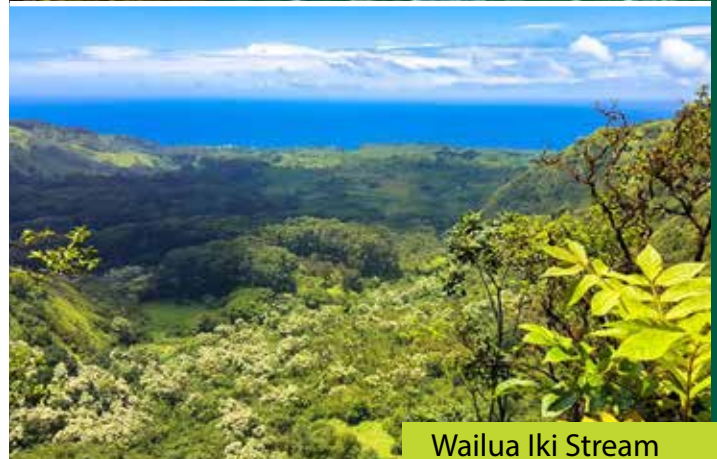
Wailua Iki Stream June 12, 2016 Outing