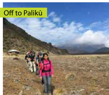
Off to Palikū