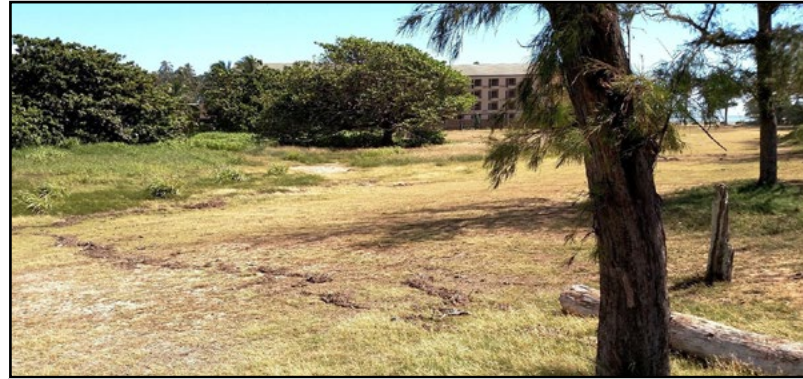
Debris line at Coconut Beach Resort (facing north)