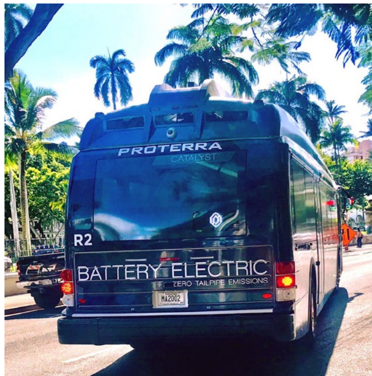
Honolulu's new electric bus has hit the roads on several pilot routes!