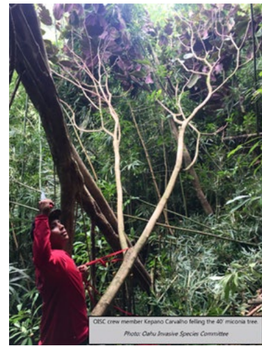
OISC crew member Kepano Carvalho felling the 40' miconia tree.

Miconia easily invades intact and undisturbed forests forming single-species stands that shade out all other vegetation. Miconia can grow to heights of 50 feet and its root systems spread outward, rather than deep in the soil, promoting erosion wherever it occurs. After just four years, miconia plants can begin fruiting, producing upwards of 9 million seeds in a single year. Impacts from miconia infestations include erosion, loss of native habitat and reduction of biodiversity, reduction of water capture and quality, and increased sedimentation of near-shore reefs. Miconia control is necessary to protect O'ahu's watersheds and the services they provide all residents.