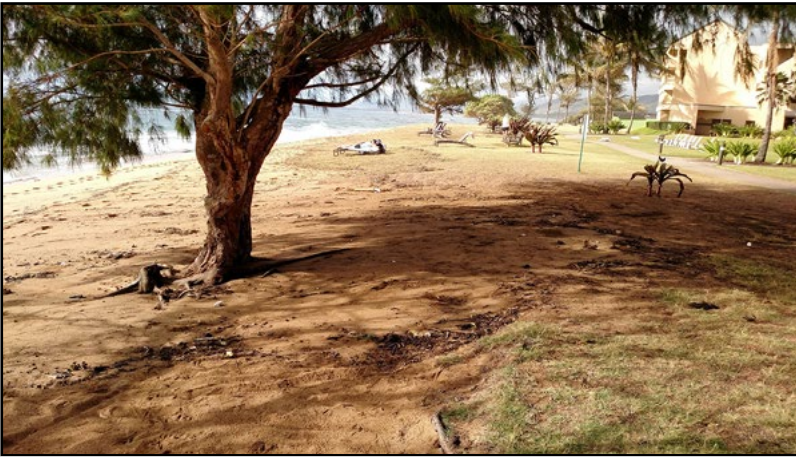
Ocean debris at Marriott Courtyard Kaua'i at Coconut Beach

At the Marriott Courtyard Waipouli, the county's final alignment for the 12-foot wide path involves widening the existing beachwalk on the makai side only. Yet, the photo below shows ocean debris in close proximity to that walkway.