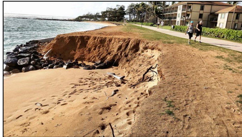
Erosion next to county path at Pono Kai Resort, Kapa'a

Continuing north, it's important to note that the coastal path in Kapa'a next to Pono Kai Resort is now only 10 feet away from recurrent erosion (see photo below).