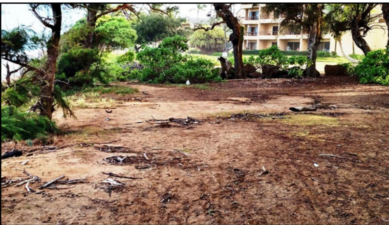
Debris line 20 feet mauka of Coconut Plantation's certified shoreline

Further north, at the undeveloped Coconut Plantation Resort, a king tide event occurred in July 2017 where the high wash of the waves extended 20 feet mauka of the certified shoreline, almost reaching the location of the county's proposed path (see photo below).