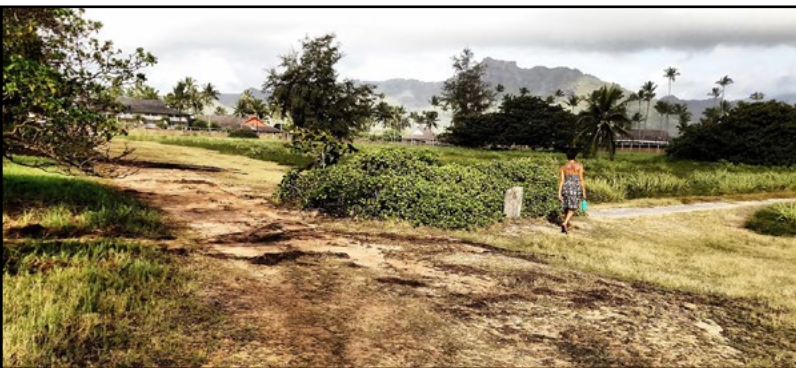
Ocean debris at Coconut Beach Resort, SPD II Makaiwa Development, LLC

However, there were some concessions. The makai portion of the proposed pool area (jacuzzi, pool bar, etc.) is located only 20 feet from the high wash of the waves shown in the September 2016 photo below. Also, sand may be used as a landscape feature near the pool entry on the mauka side of the county's multi-use path, despite being hazardous for cyclists.