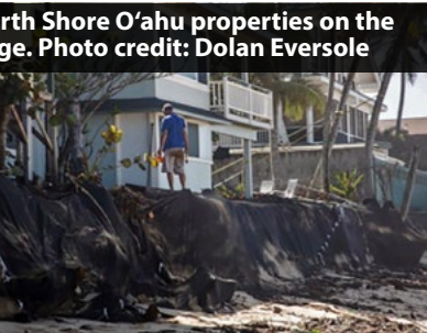
North Shore O'ahu properties on the edge.

In the final days of 2017, the Hawai'i Climate Change Mitigation and Adaptation Commission (aka Climate Commission), released their Sea Level Rise Vulnerability and Adaptation Report ( climateadaptation.hawaii.gov ), as required under Act 83 passed in 2014. The 304-page report includes specific recommendations for climate adaptation strategies to address potential sea level rise impacts. Key recommendations include mandating sellers and buyers of coastal property to disclose that the property is within sea level rise exposure areas and piloting managed retreat programs—where government agencies work together to plan for and implement the resettlement of residents and infrastructure in sea level rise vulnerability areas.