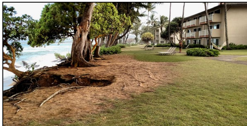
Erosion at Kaua'i Coast Resort at the Beachboy

Makai of the Beachboy Kaua'i Coast Resort, the existing sidewalk will be widened on the seaward-side even though severe erosion is a problem (see below).