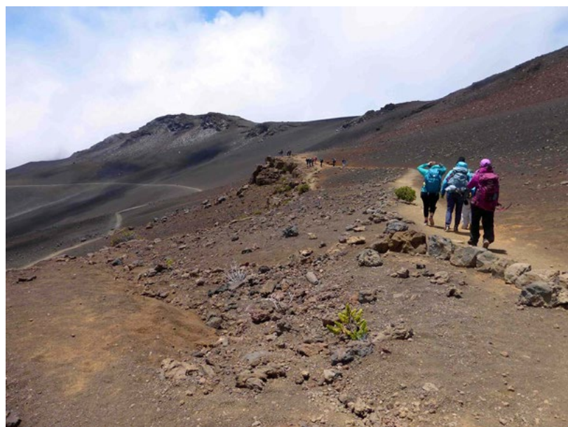
Hikers on Haleakalā National Park Service Trip, July 2017

Our accommodation for the weekend is at Kapalaoa Cabin situated in the center of Haleakalā Crater. The work will be eradicating California telegraph plant and plantago. This service trip is for hikers in good physical condition and for those who don't mind "roughing it". We have a 7-mile hike in via the Sliding Sands Trail the first day and will exit via the Halemau'u trail. Participants will have to deal with the elevation. The cabin was built in the 1930's by CCC workers and is rustic. There are no washroom or shower facilities, but there is an outhouse. We do have a 2-burner gas stove top and a wood burning stove to cook and keep warm. The reward is spending the weekend in a beautiful national park. Leader: Clyde Kobashigawa, clydekobashigawa@hawaii.rr.com