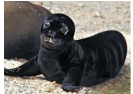
Honeygirl's pup "Ola Loa" at 4 days old.

There are only about 1,100 Hawaiian monk seals left in the world and their numbers are dropping by 3-4% a year. Most live in the Northwest Hawaiian Islands with only 200 in the main Hawaiian Islands. Their greatest risk is entanglement in nets, fishing lines, and other derelict fishing gear. In 2006, one of Honeygirl's pups—Penelope—got