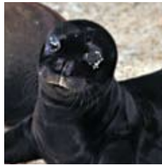
Birth of a Hawaiian Monk Seal pup