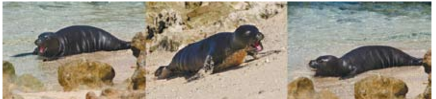
Day 10 Ola Loa playing in the water. The Hawaiian name for the monk seal is 'ilio-holo-i-ka-uaua, or "dog that runs in rough water," an apt description.