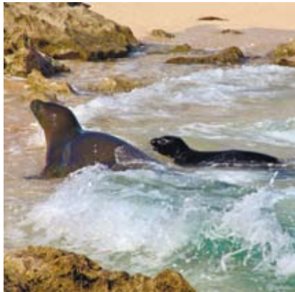
On the 24th day I saw Honeygirl and Ola Loa return from swimming in the ocean.