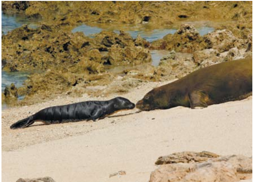
Ola Loa on Day 10... nose to nose with her mother, Honeygirl.