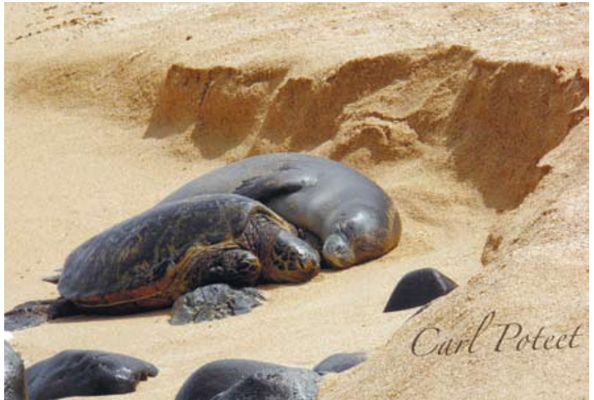
A Hawaiian monk seal and sea turtle enjoy each other's company on a North Shore beach on Kaua'i.

Members from our Group ExCom and representatives from other Kaua'i nonprofits and environmental groups attended a three-day workshop in June on the National Environmental Policy Act: How NEPA Can Help You Achieve the Results You Want. Environmental advocates from across the state gathered at UH-Hilo to share and learn from experts from Natural Resources Defense Council, Earthjustice, and the University of Hawai'i William S. Richardson School of Law Environmental Law Program. We took part in lectures and discussions that