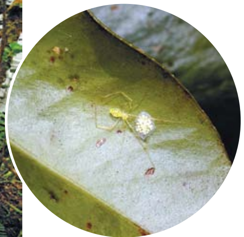
Several members enjoyed the hike on the Kaumana Trail sponsored by DLNR, where many insects were spotted, including the happy-face spider pictured above.