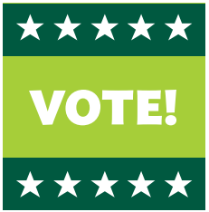
Learn about your Club leadership candidates