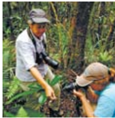
News, issues, and hikes on your island