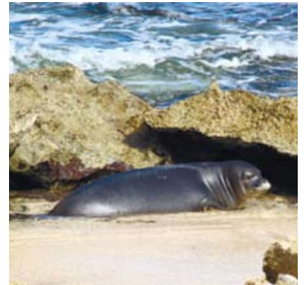
Day 45 shows a fat pup. The next year is crucial — she must forage and fend for herself.