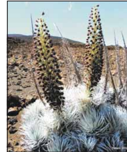
Mauna Kea silverswords, outplanted by Sierra Club members, are flowering in the alpine deserts.