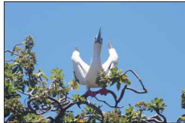
One of the more amusing displays is a courtship ritual where they lift their heads up, turn their wings upwards, and make clicking sounds.

To see a video, more photos, and the complete article on Red-footed Boobies at Makapu'u go to Nate's website at hawaiianforest.com and look under the August 2012 blog entries.