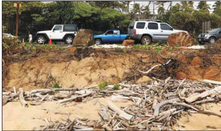
Building a concrete bike path on this narrow, eroding ledge of Wailua Beach would put the beach at risk of becoming irreversibly lost. Photo of Wailua Beach September 2012 by Judy Dalton.