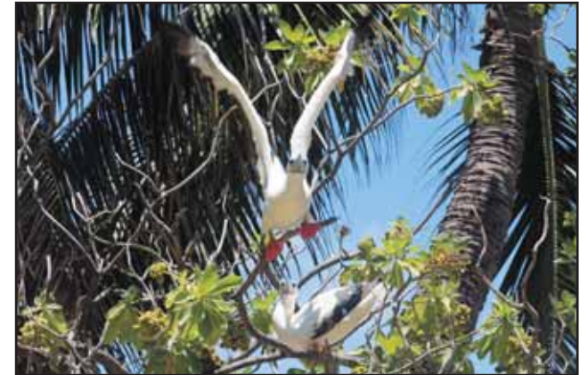
Red-footed boobies retain their mates for several breeding seasons and breed in colonies up to ten thousand pairs strong.