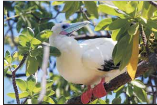
Red-footed Booby birds are named for their bright red to orange feet which are webbed and clawed.

Egg laying peaks in February through April and most offspring fledge by September, but nesting can occur throughout the year. They build nests in trees and shrubs, and incubate their eggs by covering them with their large webbed feet.