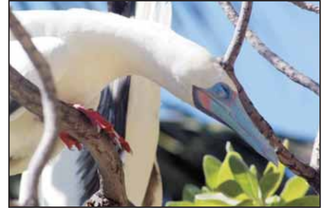
The birds have a pale blue bill with a pink base and facial skin that transitions from pink to blue.

The birds are fairly long-lived with an average life span of 20 years. They retain their mates for several breeding seasons and breed in colonies up to ten thousand pairs strong.