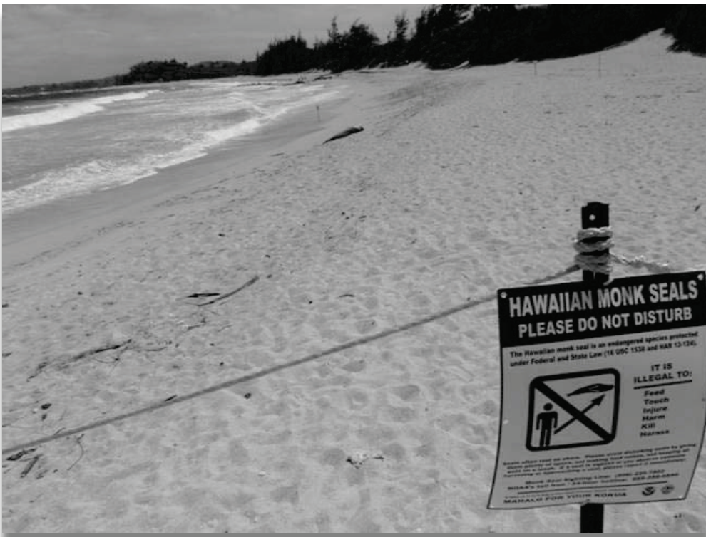
Hawaiian Monk Seal resting at Baldwin Beach, Paia, Maui