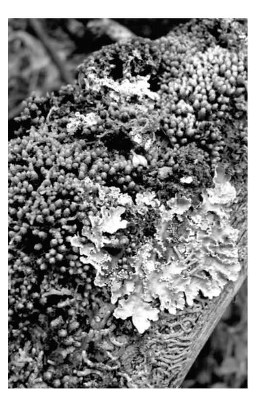
Upon closer inspection, we could see a diverse community of mosses and lichen

Several of the taller ohia lehua trees were in bloom with red flowers. One of the interesting things about the branches of ohia is that they are often covered with mosses and lichens.