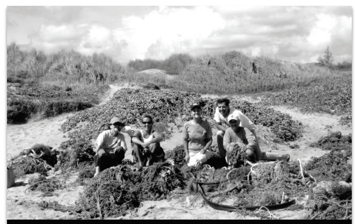
Sierra Club, Malama Maha'ulepu, and Surfrider volunteers after cutting through a large pile of washed ashore fishing nets at Maha'ulepu. These nets won't make their way back to sea to entangle marine life or damage coral reefs.

The U.S. Environmental Protection Agency (EPA) comments on this permit expressed "serious concerns" about the draft permit and identified the need to include federal effluent guidelines. We strongly concur with the EPA to strengthen permit requirements to meet the Clean Water Act goals of protecting recreational uses of our waters.