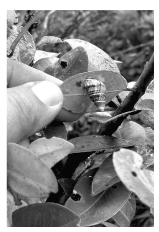
One of the cool things we found was a population of kahuli tree snails ( Achatinella mustelina ) about three-quarters of an inch long that live in trees. While kahuli are

Our explorations continued along the fence and we made our way through ohia trees with hapuu ferns ( cibotium chamissoi ) in the understory. We veered-off the fence line and descended a side-trail to explore a series of side valleys and gullies.