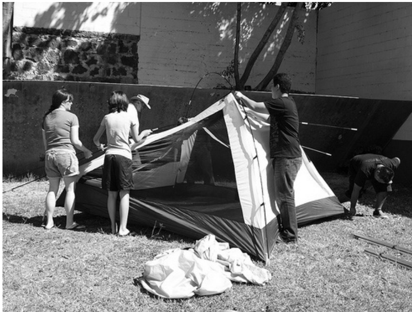
High School Hikers set up a tent in preparation for the annual Fall Hikers Workshop on October 4, 2008, at Farrington High School's ROTC building.

For more about the book, and to see a sneak preview, go to www.preservingparadisevolunteering.com – the book can be purchased through the site, and at major bookstores, such as Borders, Barnes & Noble and Amazon, or directly from the publisher at www.islandheritage.com .