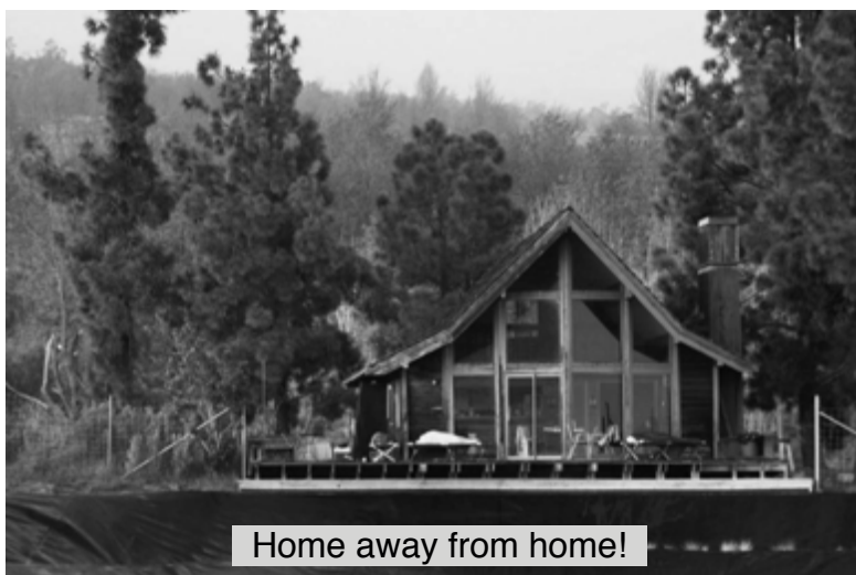
Home away from home!

HSTP trips accomplish valuable work and provide participants with a fun experience and an opportunity to visit Hawai‘i’s wild places that may not usually be accessible. Please take a look at www.sierraclubhawaii.com/hstp if you’re interested in learning more or would like to be added to our email trip notice list.