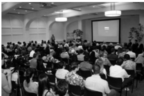
Over a 150 people eagerly gathering

Promoting a financing system that will make it easy for homeowners and businesses to go green