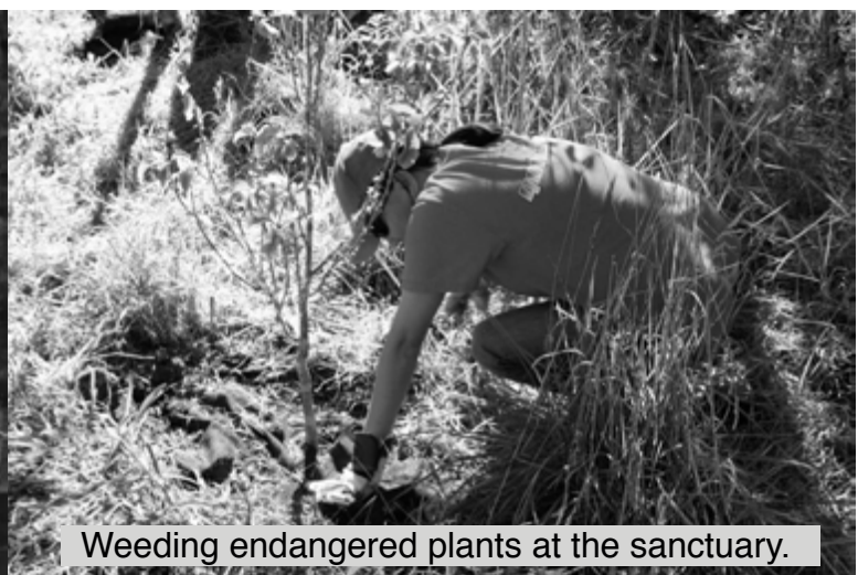
Weeding endangered plants at the sanctuary.