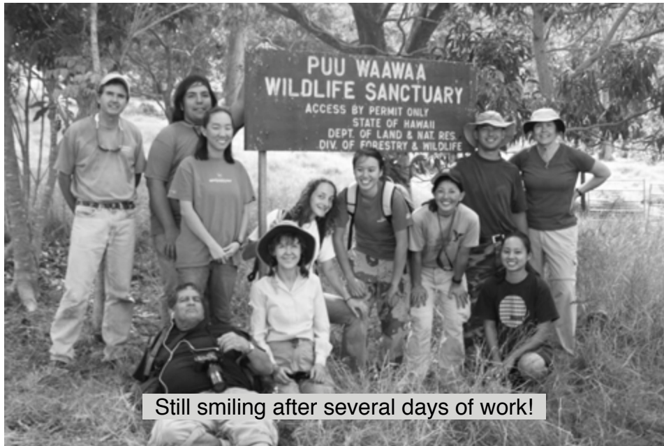
Still smiling after several days of work!

Of course, HSTP trips are not all work, and we enjoyed good food, evening card games, spectacular night skies, and lots of laughter and new friendships. On our day off, we witnessed the big surf at Hapuna Beach, and spent the afternoon enjoying beautiful Kīholo Bay (part of the Pu‘u Wa‘awa‘a ahupua‘a. It was especially rewarding to have so many young adults on this trip, which bodes well for the future of HSTP and conservation efforts in Hawai‘i.