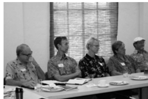
Interested participants engage in a breakout session on how to implement a PACE program