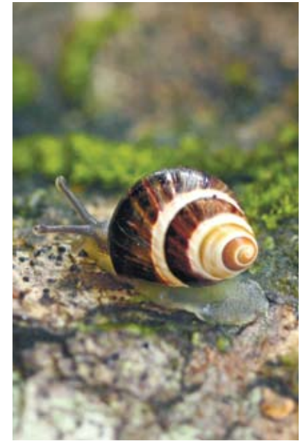
A juvenile kāhuli at a half-an-inch long.