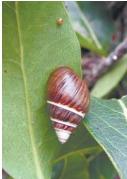
Adult kāhuli 3/4 of an inch long shares leaf with tornatelides snail 2 millimeters in length.