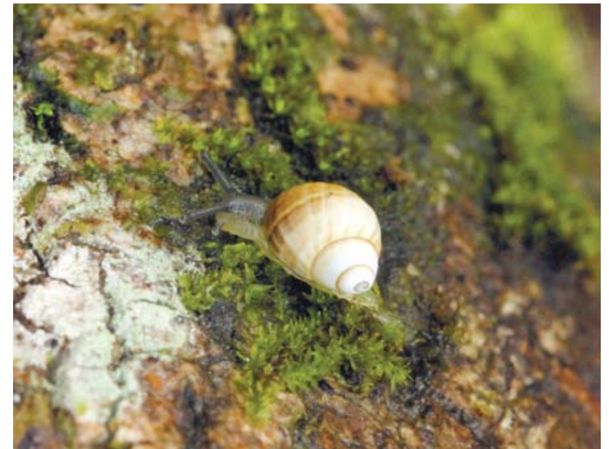
When baby kāhuli are first born they are only about 4.6 mm in diameter. This specimen is just under a quarter-inch long or about 6.35 mm.