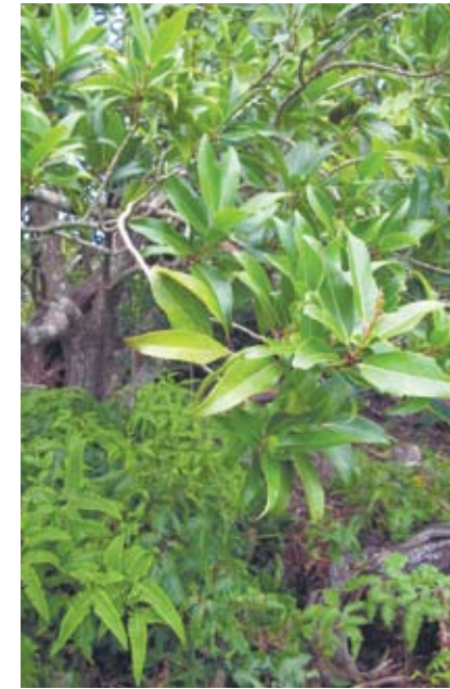
The olopuia tree, a favorite of the kāhuli.

To read more about the baby kāhuli in the native forest, visit my blog at: http://hawaiianforest.com/baby-kahuli-in-the-native-forest