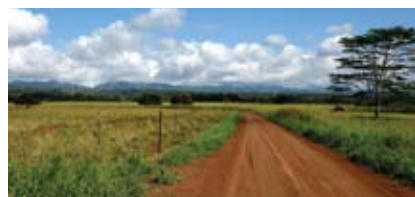
The Koa Ridge saga continues...

The plan was approved in 2002 and, by ordinance, is supposed to be reviewed every 5 years. The current review, which should be finished by early next year, is the first ever. The COSCP is supposed to dictate planning in the area. We believe zoning decisions should defer to planning decisions—