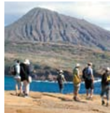
News, issues, and hikes on your island