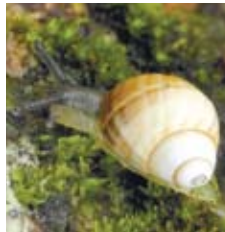
Baby kähuli (O'ahu tree snail) in the native forest